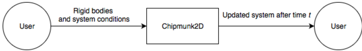
Figure 1: System Context